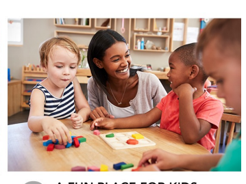
A FUN PLACE FOR KIDS If you have children under kindergarten age, please drop them off in our Preschool Center for fun Bible lessons. If you would like to keep them with you, please enjoy our Cradle and the Crib. The Cradle is a private area for mothers and babies only. The Crib may be used by parents with their preschool children.

To learn more about getting connected, visit shadowhills.org.